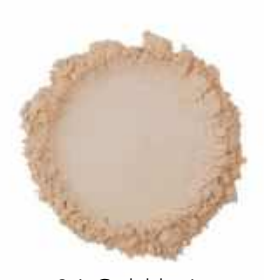
04 Cold beige